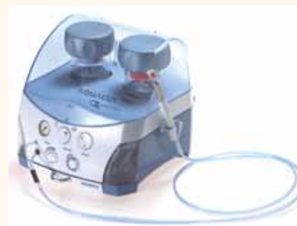
The Aquacut Quattro