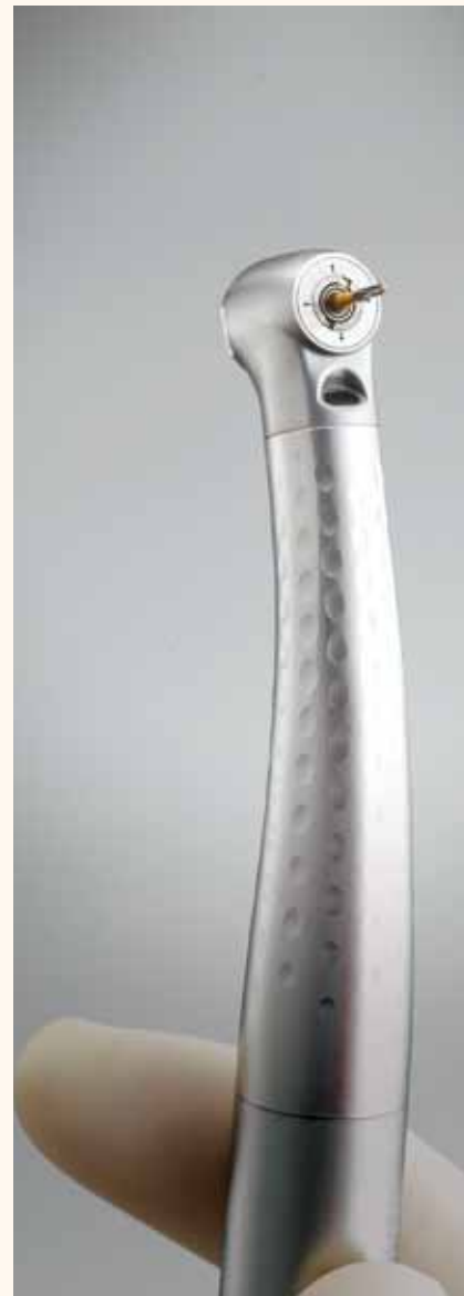
The DENTSPLY Midwest Stylus ATC.

And the Midwest Stylus ATC's STS allows the handpiece to operate at speeds of 330,000 RPM under