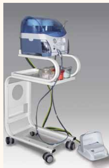
The Aquacut Quattro and stand.